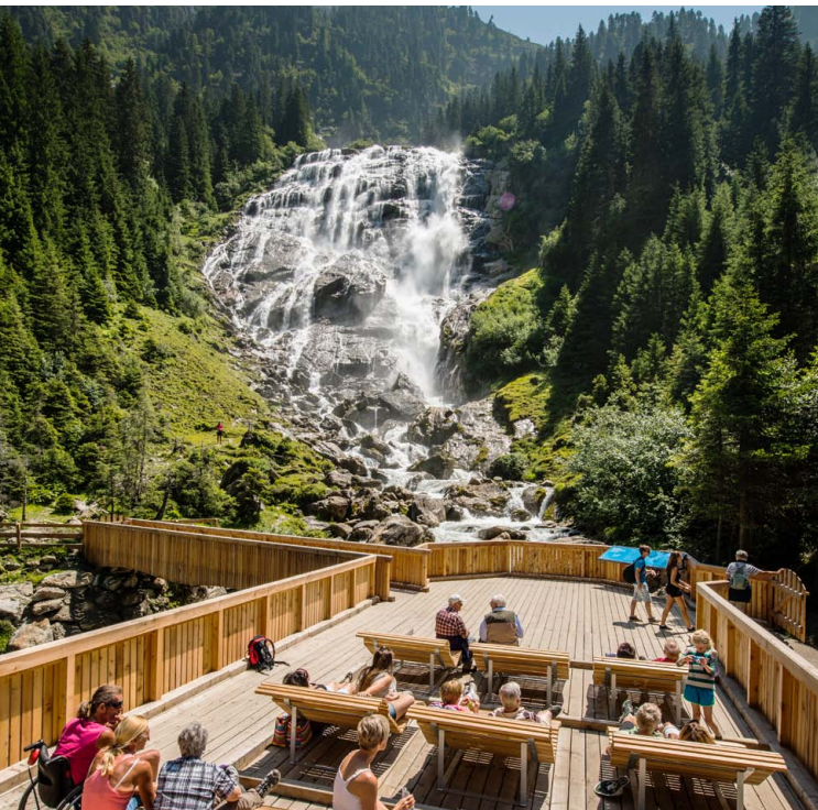
The barrier-free, accessible platform at the Grawa Waterfall

The Wild Water Trail invites hikers to look at the glacial high valley as if it were an open book, from which one can read: the landscape-forming power of the water is a fascinating story full of dramatic incidences.