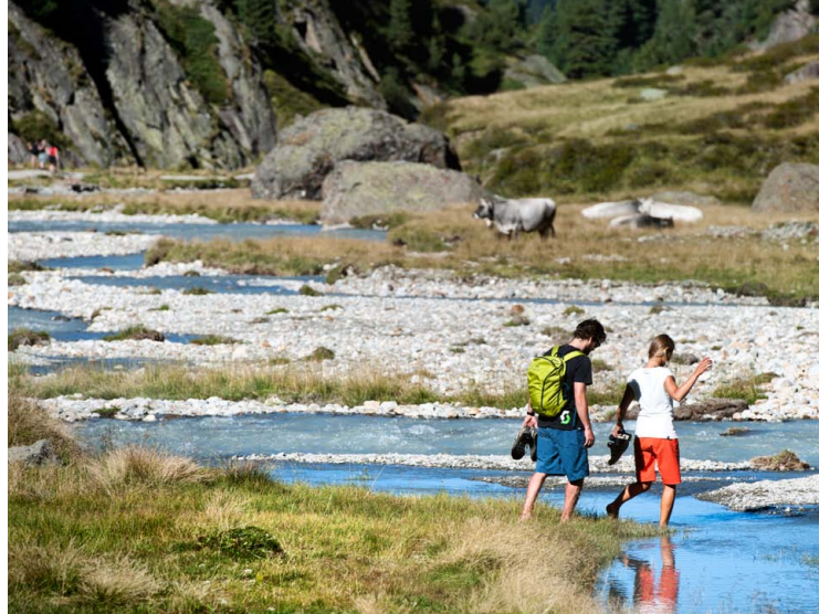
Hiking at the Stubai Wild Water Trail: exercise and well-being